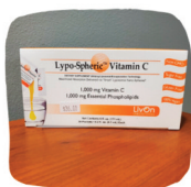
Lipo-Spheric Vitamin C

This talk is for new and current patients who would like to know more about the clinic!